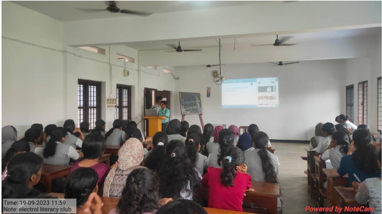
Time: 19-09-2023 11:59 Note: electrol literacy club