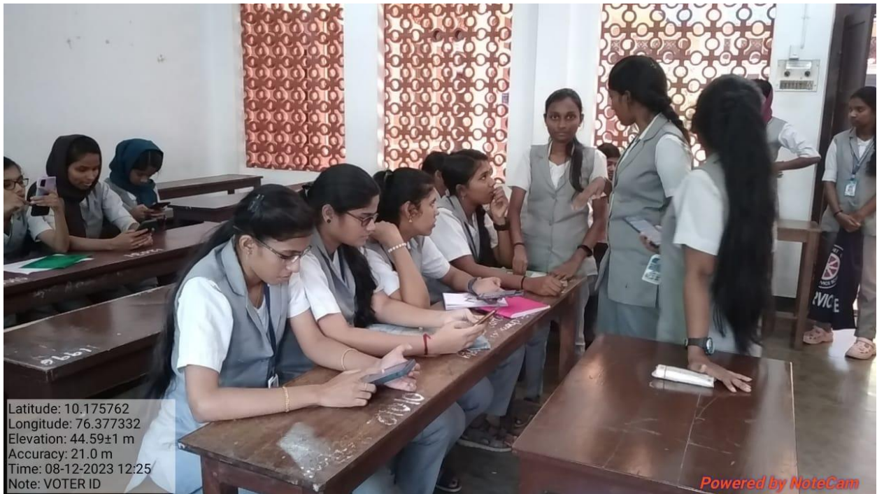
Latitude: 10.175762 Longitude: 76.377332 Elevation: 44.59±1 m Accuracy: 21.0 m Time: 08-12-2023 12:25 Note: VOTER ID