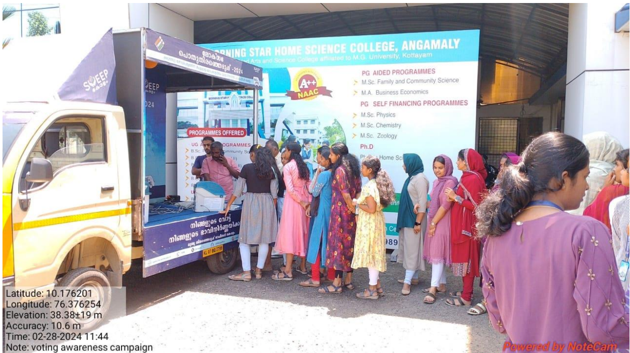
Latitude: 10.176201 Longitude: 76.376254 Elevation: 38.38±19 m Accuracy: 10.6 m Time: 02-28-2024 11:44 Note: voting awareness campaign