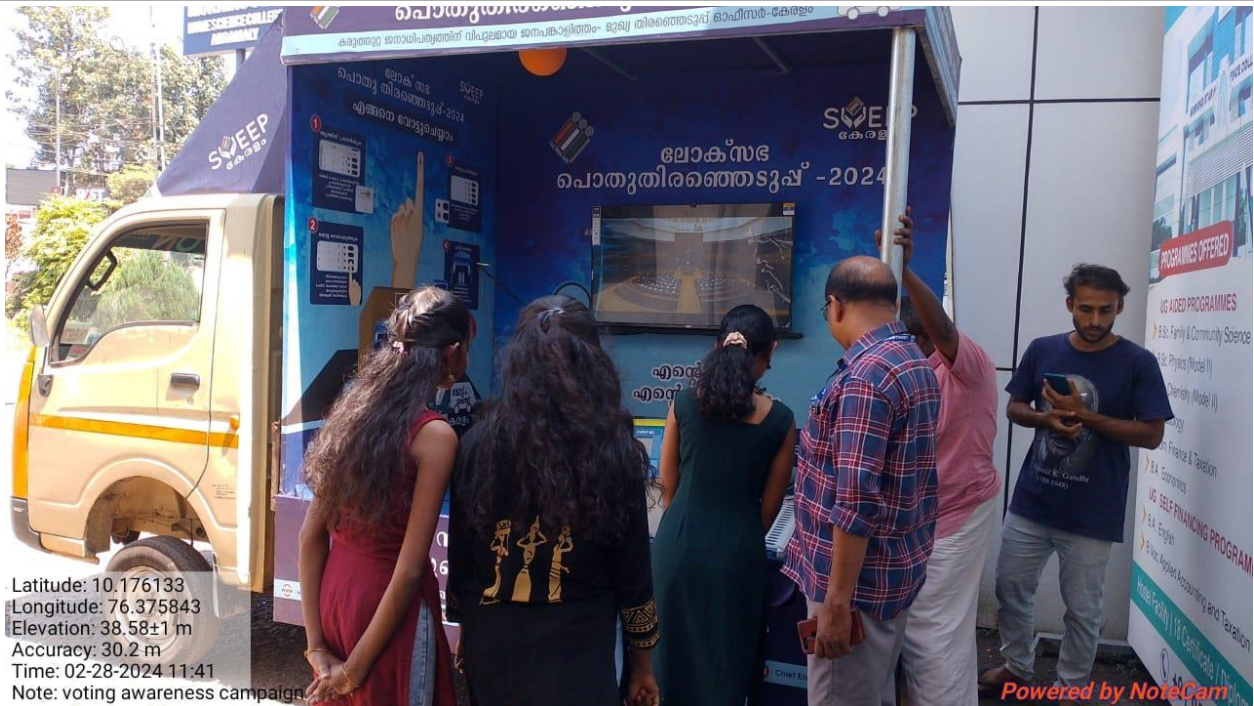
Latitude: 10.176133 Longitude: 76.375843 Elevation: 38.58±1 m Accuracy: 30.2 m Time: 02-28-2024 11:41 Note: voting awareness campaign