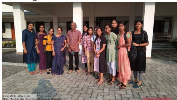
Figure 4 Red Cross members with the trainers

Eleven members of the Youth Red Cross attended 16 hours training for volunteer in Palliative care at Knowledge Centre, Peace Mission Centre, Nedumbassery and received certificates.