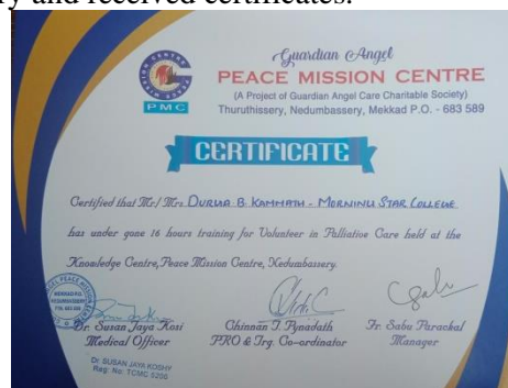
Figure 5 Palliative Care Training Certificate