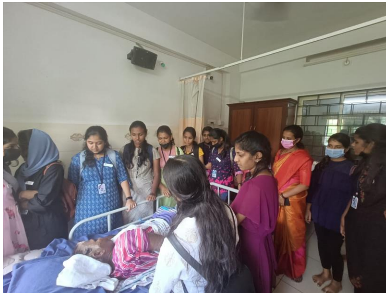
Figure 2 Students interacting with the inmates