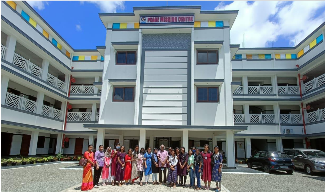
Figure 1 Students at the Peace Mission centre